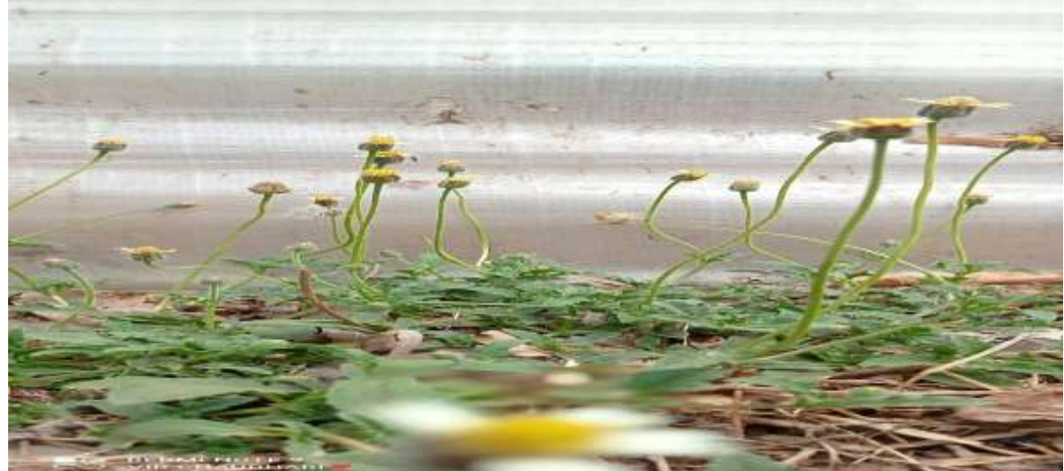
Fig. 3. Image during Collection of T. Procumbens

TridaxProcumbens Morphology and Pharmacological Activity: