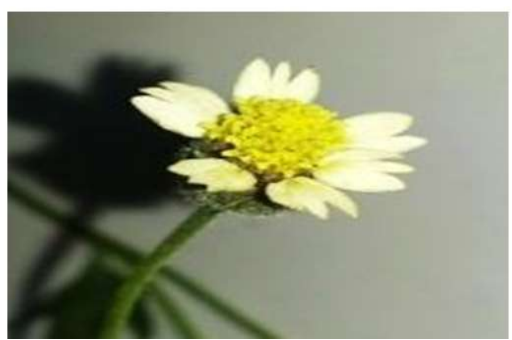
Fig. 2: Flower of TridaxProcumbens