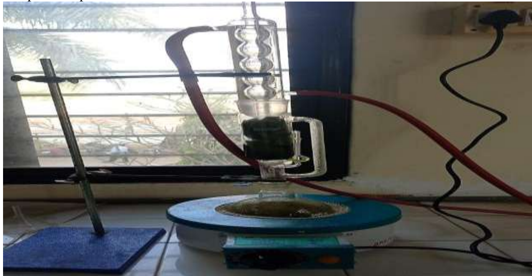
Fig. 5: Extraction Assembly for T. Procumbens

5. After extraction the solvent is removed typically by means of a rotary evaporator yielding the extracted compound. The non-soluble portion of the extracted solid remains in the thimble, and is usually discarded.<sup>[8]</sup>