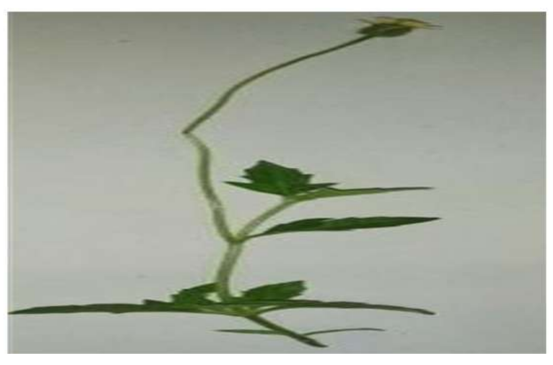
Fig. 1: Aerial Part of TridaxProcumbens